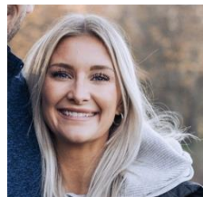
Kourtney Vier Mother USA